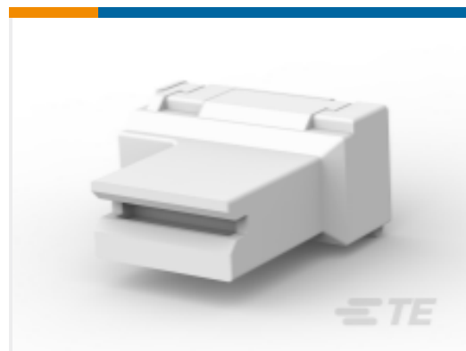
TE Part # 1969656-1 250 FASTON HSG.,FLAG,REC.,1 POS, NATURAL