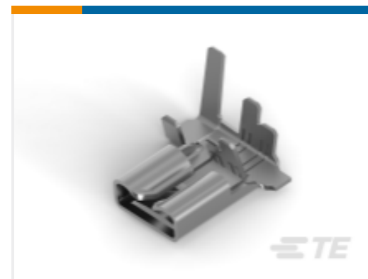
TE Part # 2238171-3 250 FASTON,FLAG,REC.,22-12 AWG, TPBR