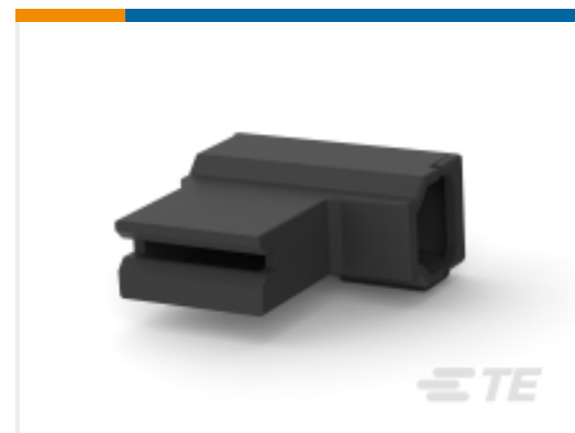
TE Part # 1969657-1 250 FASTON HSG.,FLAG,REC.,1 POS, BLACK