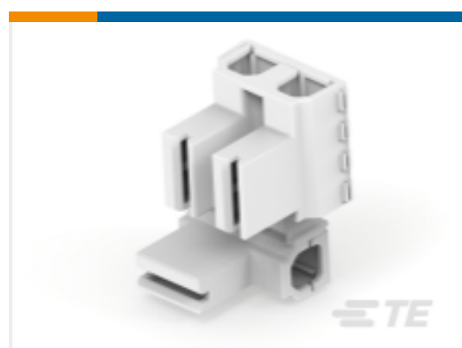
TE Part # 2238270-1 HSG, RECEPT, 250 FASTON FLAG, 3P, T9G