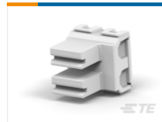
TE Part # 1969900-1 250 FASTON HSG.,FLAG,REC.,2 POS, NATURAL